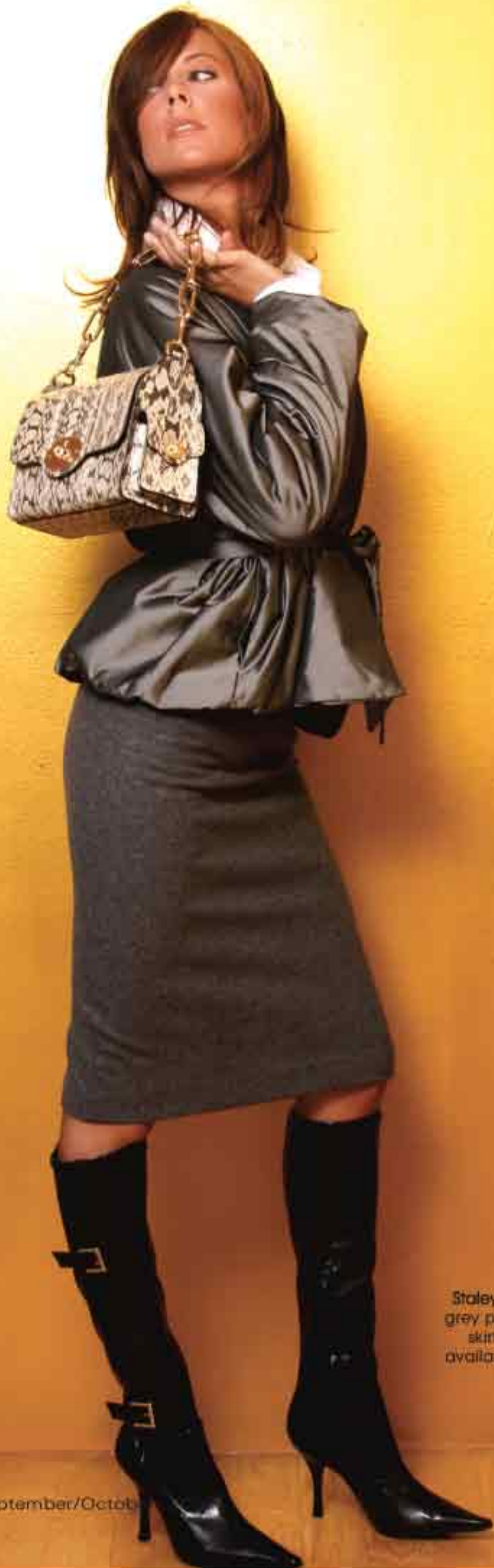
Staley: White ruffled blouse by Walter Voulaz, grey puffer jacket by Max Marra, grey flannel skirt by Gunex and lizard bag by Mulberry available at Hamrah's, Dresskill. Black leather boots with silver buckles by BCBG Girls available at Shoe Inn, Englewood.