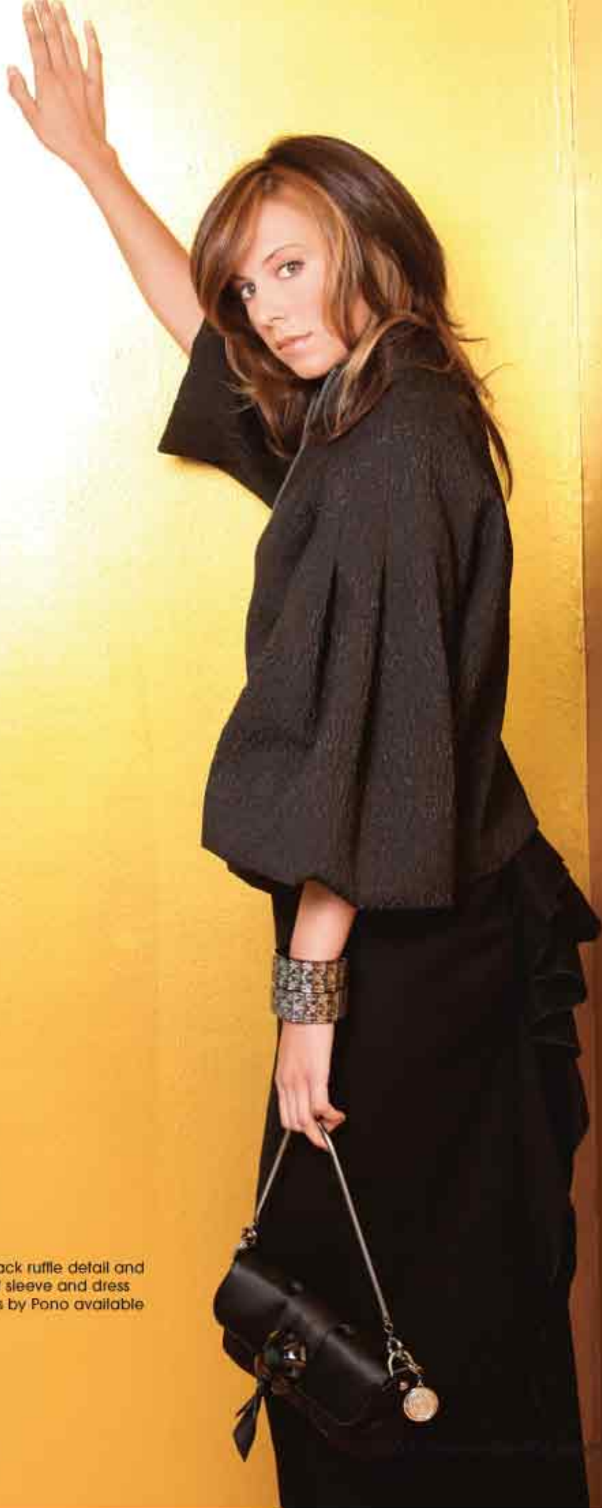
Staley: Black skirt with back ruffle detail and cropped jacket with puff sleeve and dress bag by Lanvin, bracelets by Pono available at Hamrah's, Cresskill.