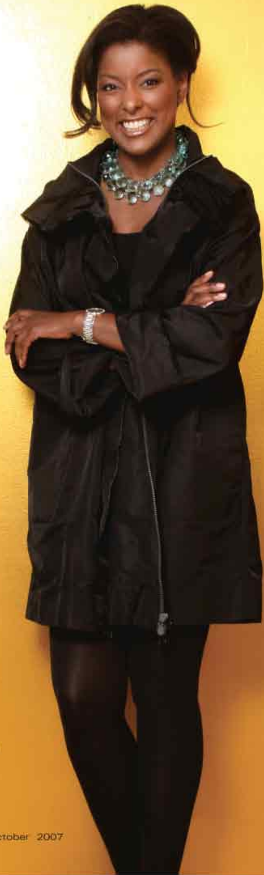
Lori: Black long nylon jacket by Larvin, black tank and leggings by Wolford, earrings by North/South and Czech glass bead necklace by Detra available at Hamrah's, Cresskill. Watch by Piaget available at The Timepiece Collection.